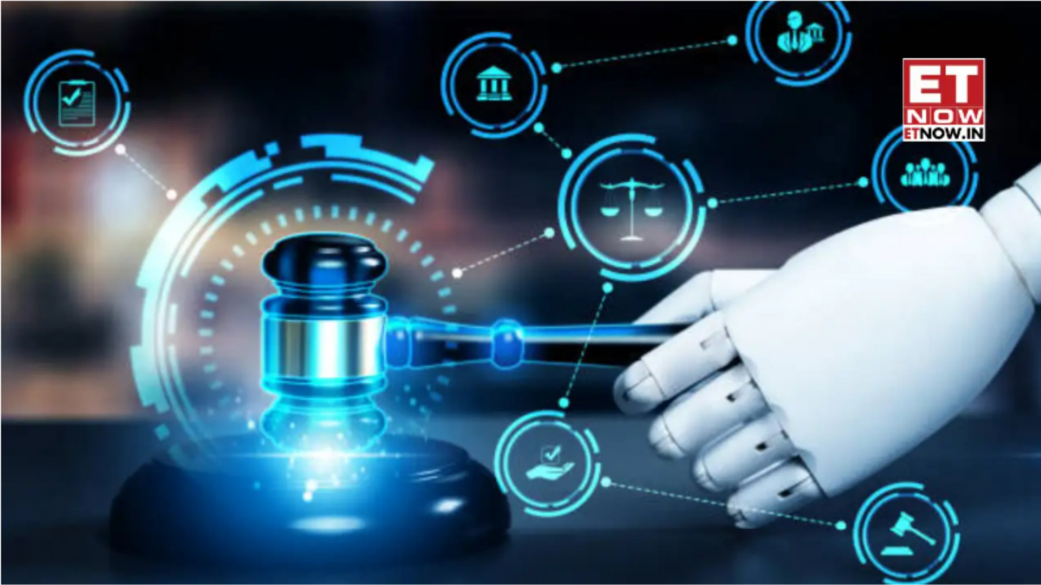
UPES Dehradun to launch AIVR simulation lab for students.